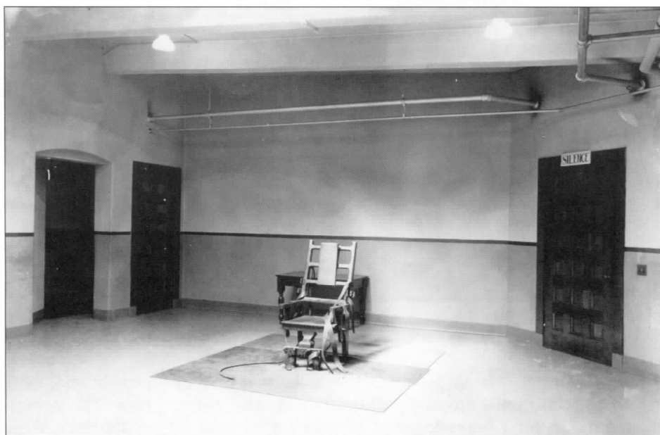
View of the execution chamber at Sing Sing. Behind the recessed door on the left was the station from which the state's executioner operated the controls.

meter, rheostat and switch. Attached to the back of the chair was the head electrode which was finally held in place by means of a spiral spring. The body electrode was attached to the lower part of the back of the chair in order to contact the hollow of the sacrum. The electrodes each consisted of a bell-shaped rubber cup about 4 inches in diame-